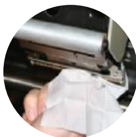
EZ-View Screen Wipes

Regardless of use, sooner or later your printer for data or cards will become dirty because of dust, glue residue or other external influences. These impurities adhere to and are burnt into the printer head. This is easily noticed by waning sharpness of the printing, blurred photos or any data on the cards, which can lead to an expensive change of printer head if the printer is not cleaned. For best printing quality and service life, clean your printer at regular intervals.